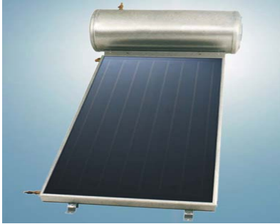
Solar Water Heating System (FPC)