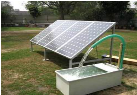
Solar Water Pump