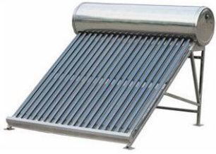
Solar Water Heating System (ETC)